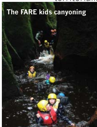
The FARE kids canyoning

Since April this year we have secured funding from GHA and Communities Scotland to employ Family Action Rogerfield Easterhouse (FARE) to provide youth activities and support within Cranhill and in partnership with Tower Homes HA and Cairnbrook HA. The project, which will run for 2/3 years will help tackle gang culture and territorialism. A number of